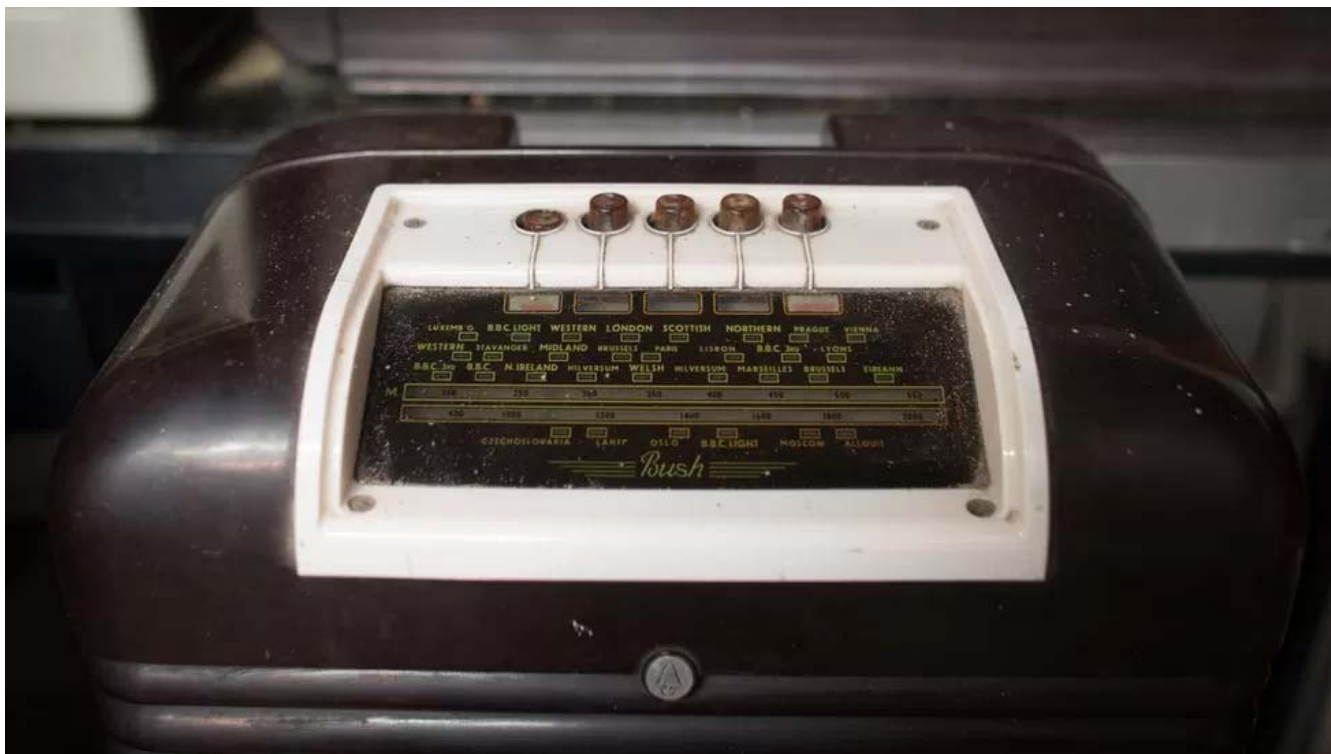
A radio made from Bakelite

The first synthetic plastic - plastic made entirely from man-made materials - was created over 100 years ago.